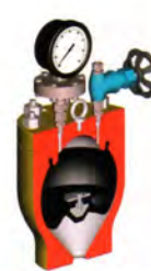
Diaphragm puls. dampener